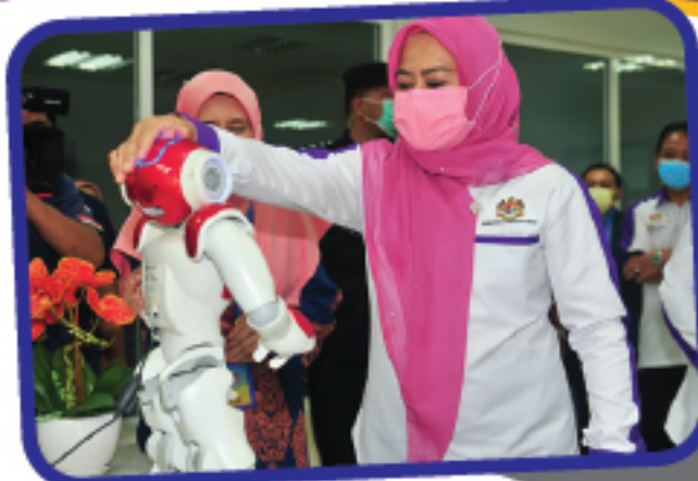
MoHE Minister, Datuk Seri Dr. Noraini Ahmad is seen interacting with the humanoid robot that is used for therapy in children with neurological and behavioral disorder.