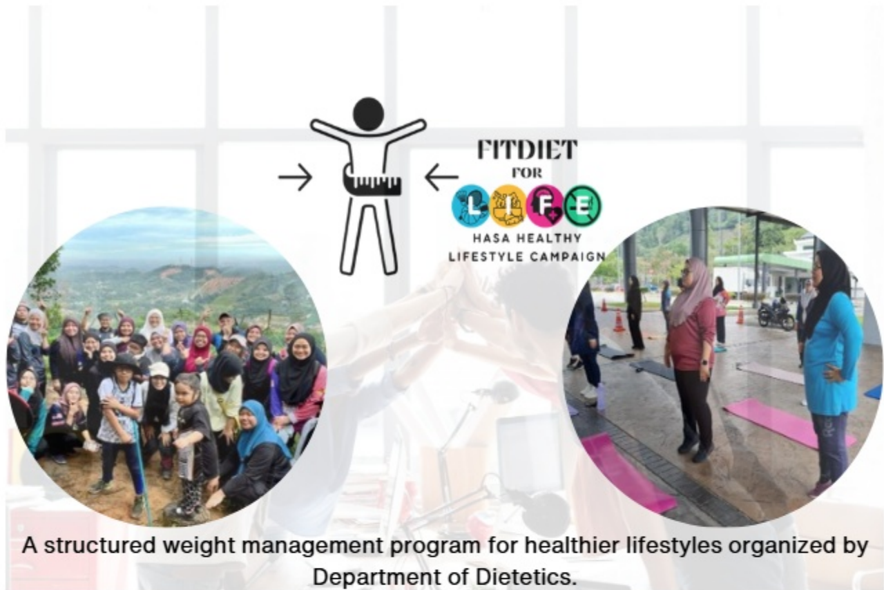
A structured weight management program for healthier lifestyles organized by Department of Dietetics.