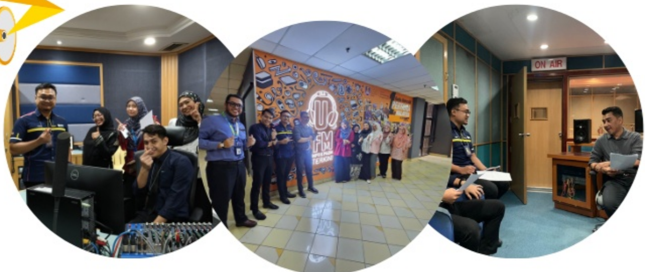
Trained staff as Public Service Announcer for health promotion.