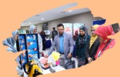
Health education booth visit.