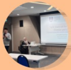
Health talk by physiotherapist.