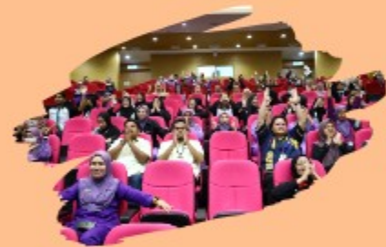
Practical exercise session during the health talk.