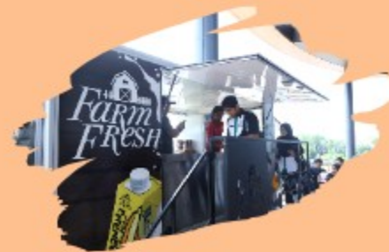
Free nourishing drinks.