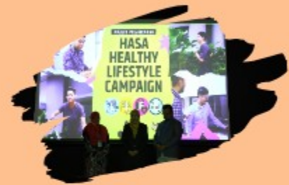
LIFE's launching ceremony.