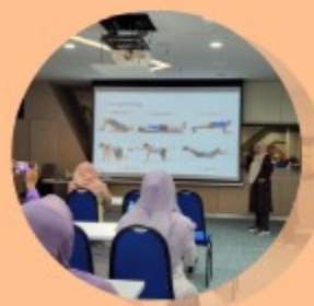
Health talk by occupational therapist.