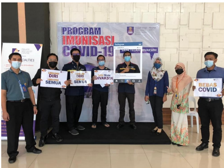
COVID-19 vaccination programme