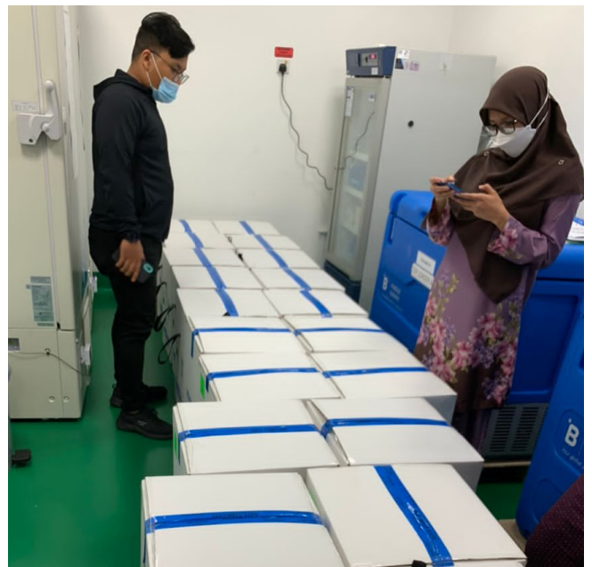
Receiving & Storage of COVID-19 vaccines (Pfizer Comirnaty vaccines)