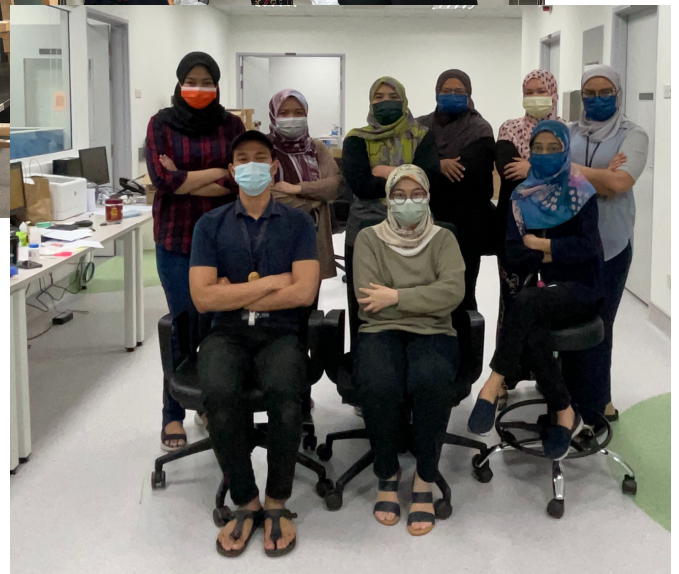
Setting up of Ward Supply Pharmacy Unit