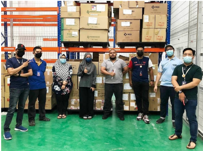
Setting up of Medical Store Unit